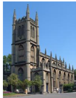
St Mary's (by Bathwick Hill roundabout)