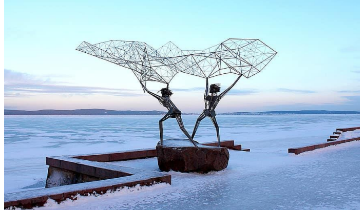
sculpture by Rafael Consuegra (b.1941), The Fishermen (1991)

22 January 2023 3 rd Sunday after Epiphany