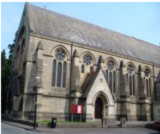
St John's (opposite the fire station)