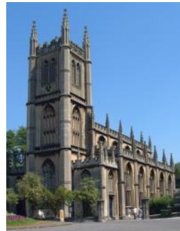
St Mary's (by Bathwick Hill roundabout)