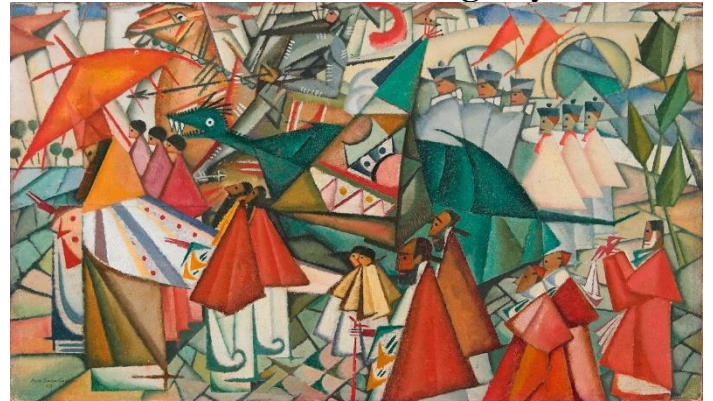
Amadeo de Souza Cardoso (1887-1918), Corpus Christi Procession (1913)

A very warm welcome to you all to our Mass as we give thanks for the gift of the Blessed Sacrament of Jesus' eucharistic Body and Blood.